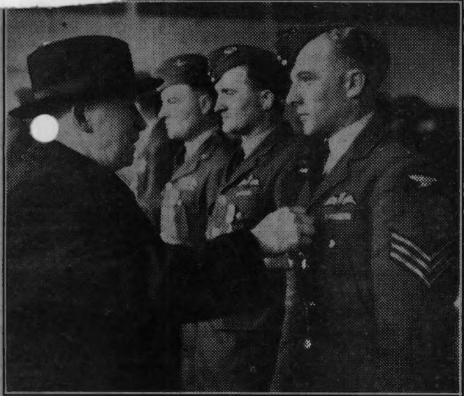
DR. BENES , President of the Czechoslovak Republic, visited an R.A.F. station on Saturday and decorated Czech and British members of a Czechoslovak fighter squadron which has brought down 36 enemy aircraft in combats over Britain.