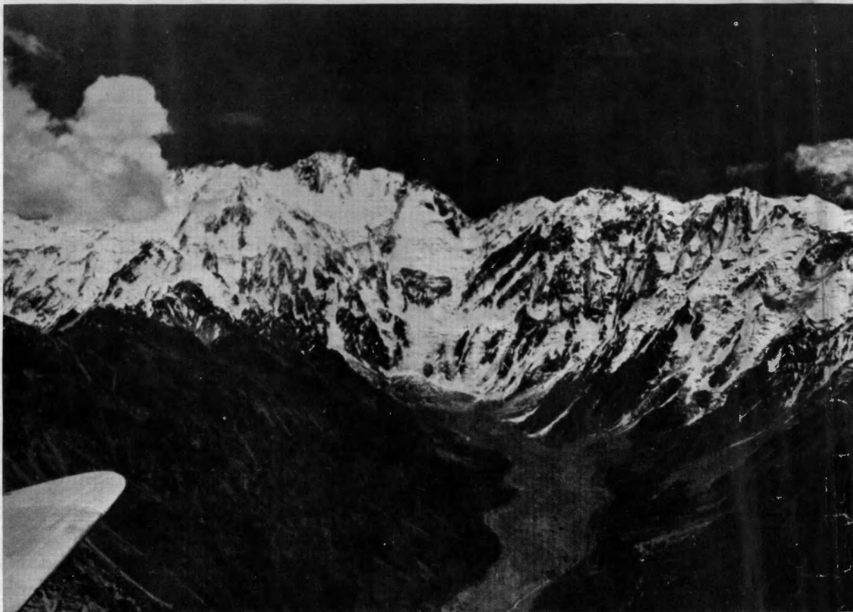
AN AERIAL VIEW OF PART OF THE ROUTE TAKEN BY THE NANGA PARBAT EXPEDITION : This picture is taken from the north-east, and the space in the centre was the site of the Austro-German team's first camp. Nanga Parbat, the eighth highest mountain in the world, has become known as the "Killer Mountain," because of the many lives it has claimed.